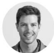
JUSTIN DUNCAN COMMUNICATIONS